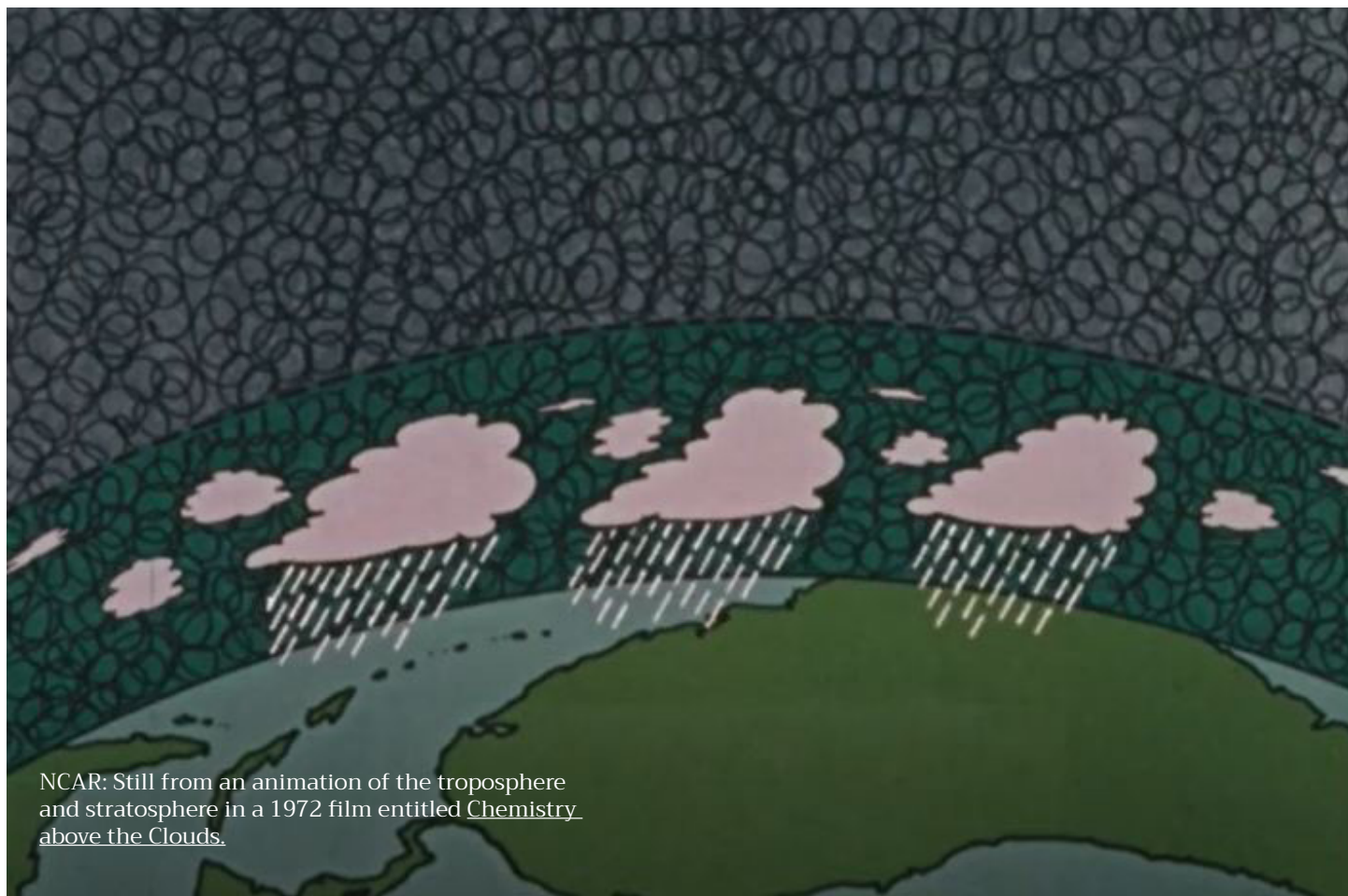
NCAR: Still from an animation of the troposphere and stratosphere in a 1972 film entitled Chemistry above the Clouds .