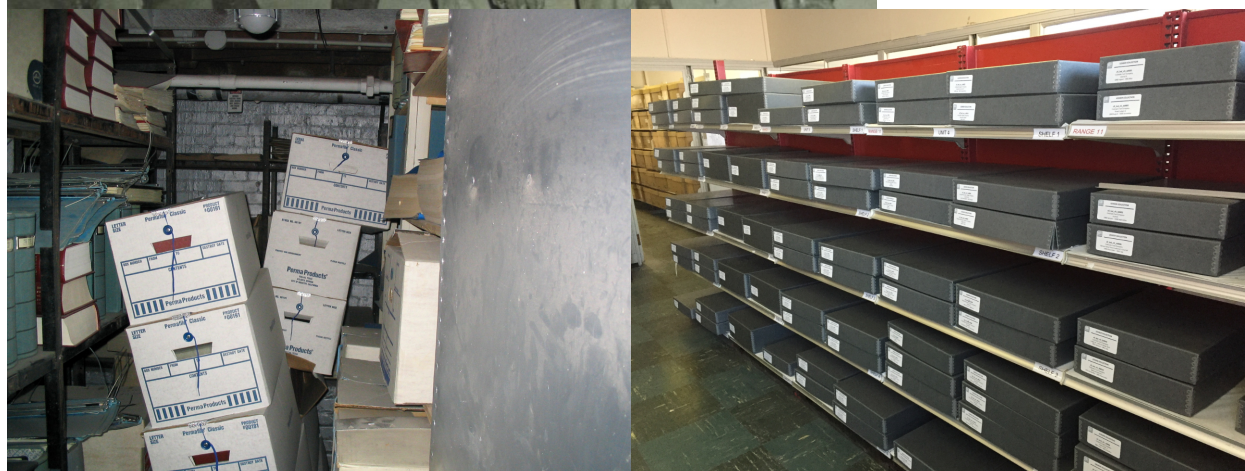
Below: Records in the archives before and after rehousing.

out, and you can really see that in this archive. The steel and mining professions were extremely dangerous and because of the hazards, the fire, the heat, and the noise, so people had to look out for each other.