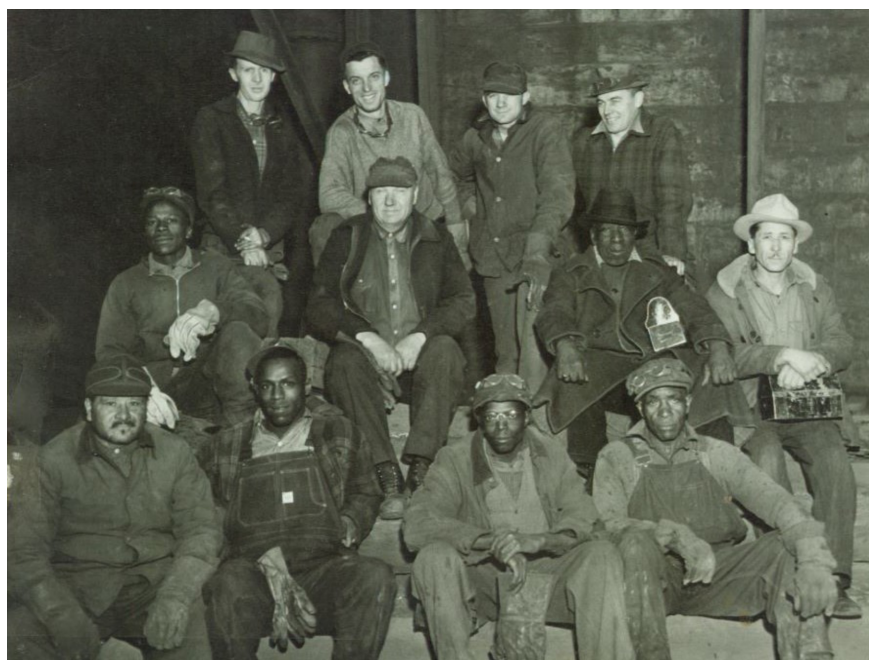
Left: CF&I blast furnace workers circa 1945.