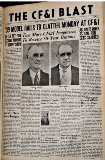
CF&I Blast January 20 th , 1939.

A: It was. When you read stories in the newspapers and listen to oral histories – we collect oral histories to get the workers' point of view – it really was a family. People looked out for each other and helped each other