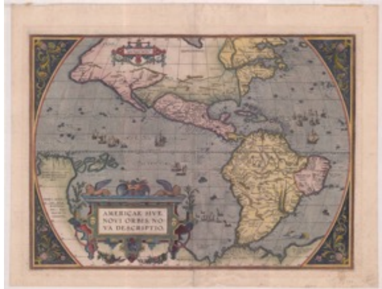
The DPLA model helps you plug your institution's own photographs, maps, etc.