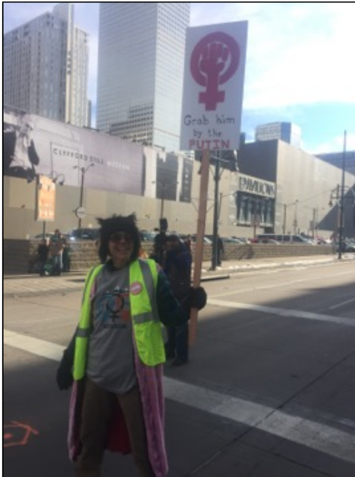
Women's March protester

During the collecting phase, I corresponded with donors by email, phone and in person. I strived to have every donor sign a gift form and to give me background about the items they were donating. In