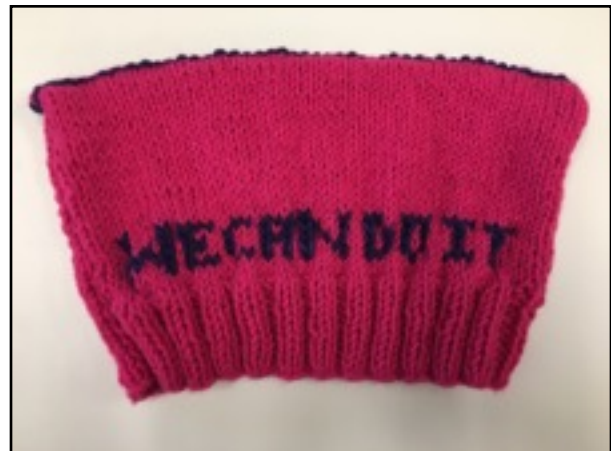
Women's March hat Denver Public Library, Western History Collection, WH2371

On Sunday, we posted a donation call on the WHG Facebook page. The post reached 25,440 people and was shared 234 times within the next few weeks. We received over 250 emails that resulted in donations of over 1,200 digital photos/videos, 105 protest signs and 12 pieces of ephemera such as "pussy" hats, buttons, and artwork.